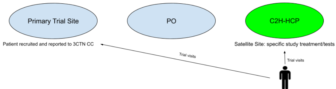
Figure 1. Possible scenarios for remote access patients